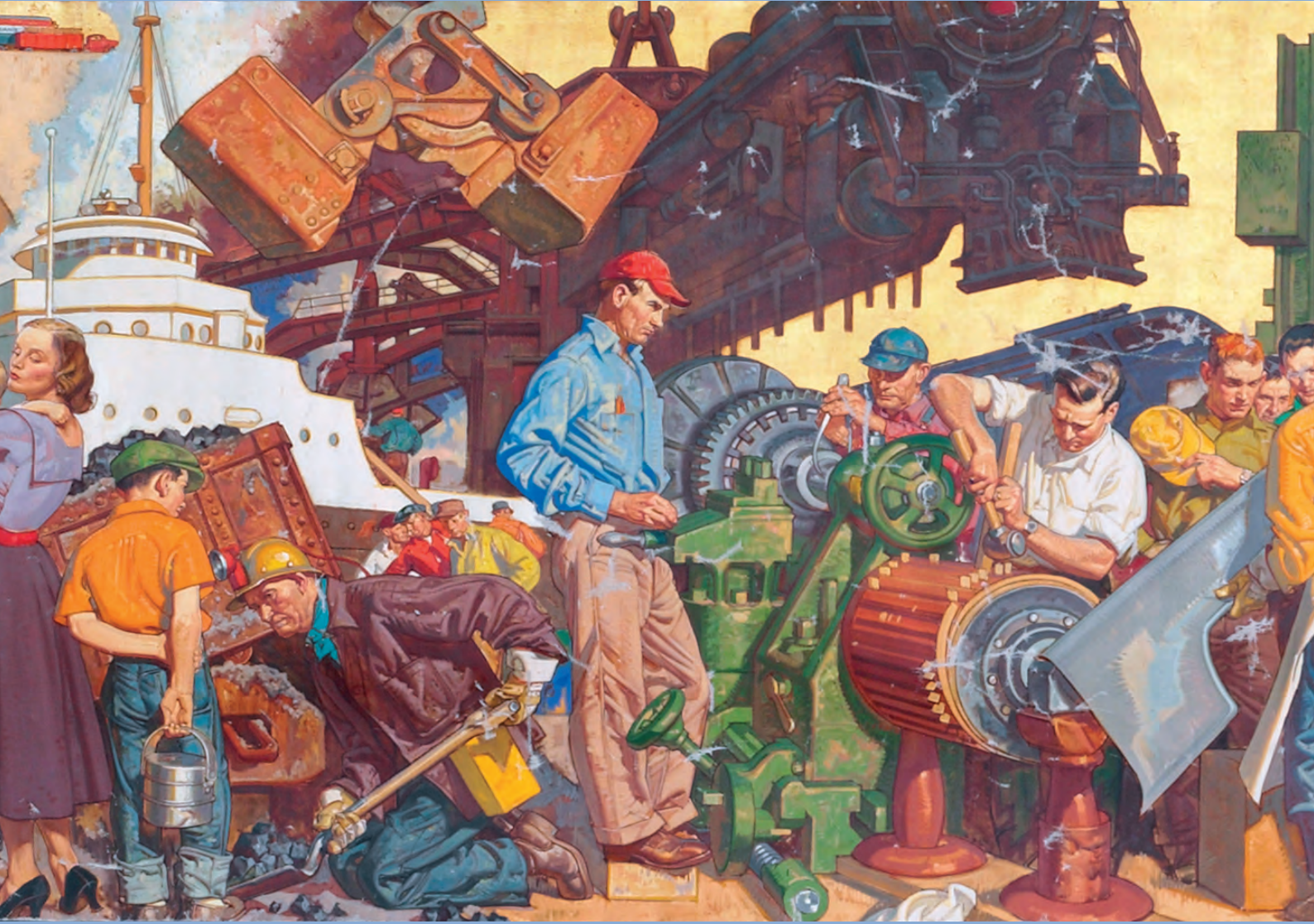
A Dean Cornwell mural (1955) located at the Centre William Rappard in Geneva, Switzerland which is home to the World Trade Organization.