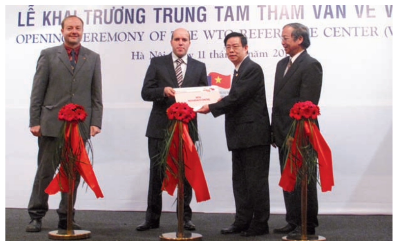
Opening Ceremony of the Reference Centre at the Viet Nam Institute for Trade.

In parallel with the establishment of the RC, training on accessing WTO information resources, including tariff profiles and commitments of WTO Members, the Global Trade-Related Technical Assistance Database (GTAD) and other WTO databases, reports of WTO bodies and developments in the Doha negotiations, was provided to the RC Manager, senior officials from the Ministry of Industry and Trade. The RC Manager and staff members also received training on information management techniques to assist them in better organizing and providing access to WTO information resources. The Centre will serve as the interface between the WTO and the Ministry, and will be accessible to the general public as well as the private sector and the academics. The creation of this RC at the VIT was welcomed by many officials and is going to be used also as a learning centre where