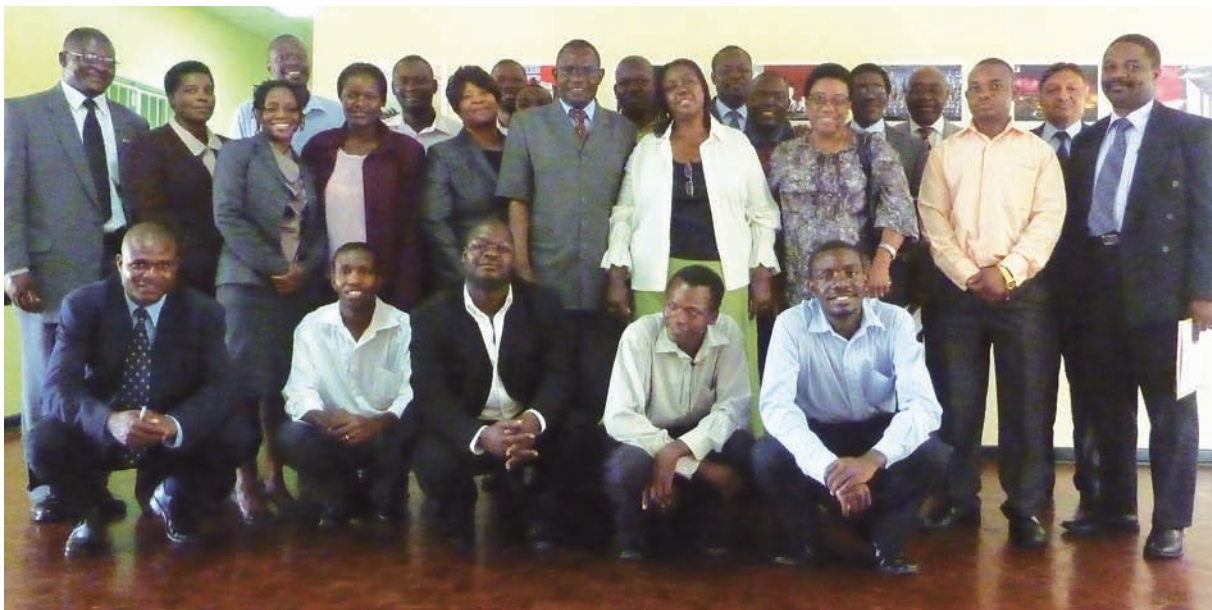
Participants of the training delivered during the occasion of the opening of the WTO Reference Centre.

We anticipate to produce papers on these issues and any support that can be given by the WTO will be appreciated.