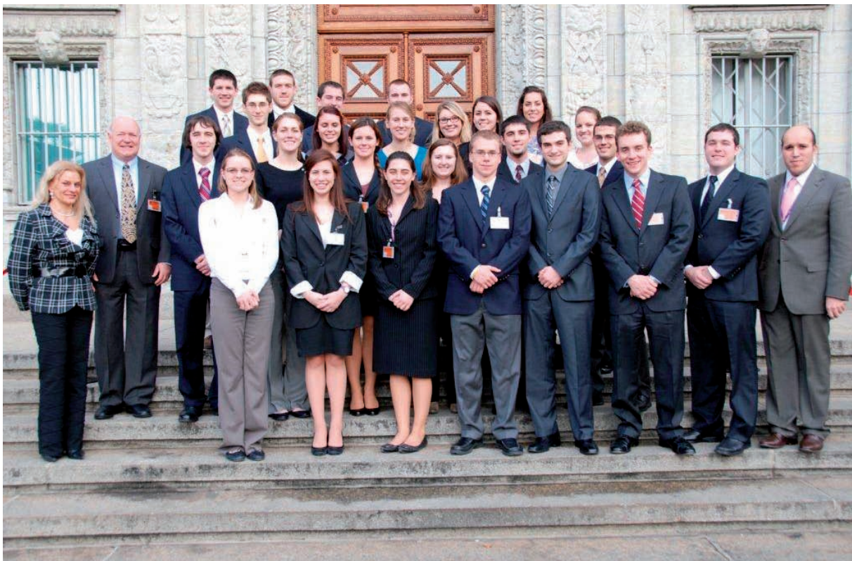
Group of students from the University of Delaware.